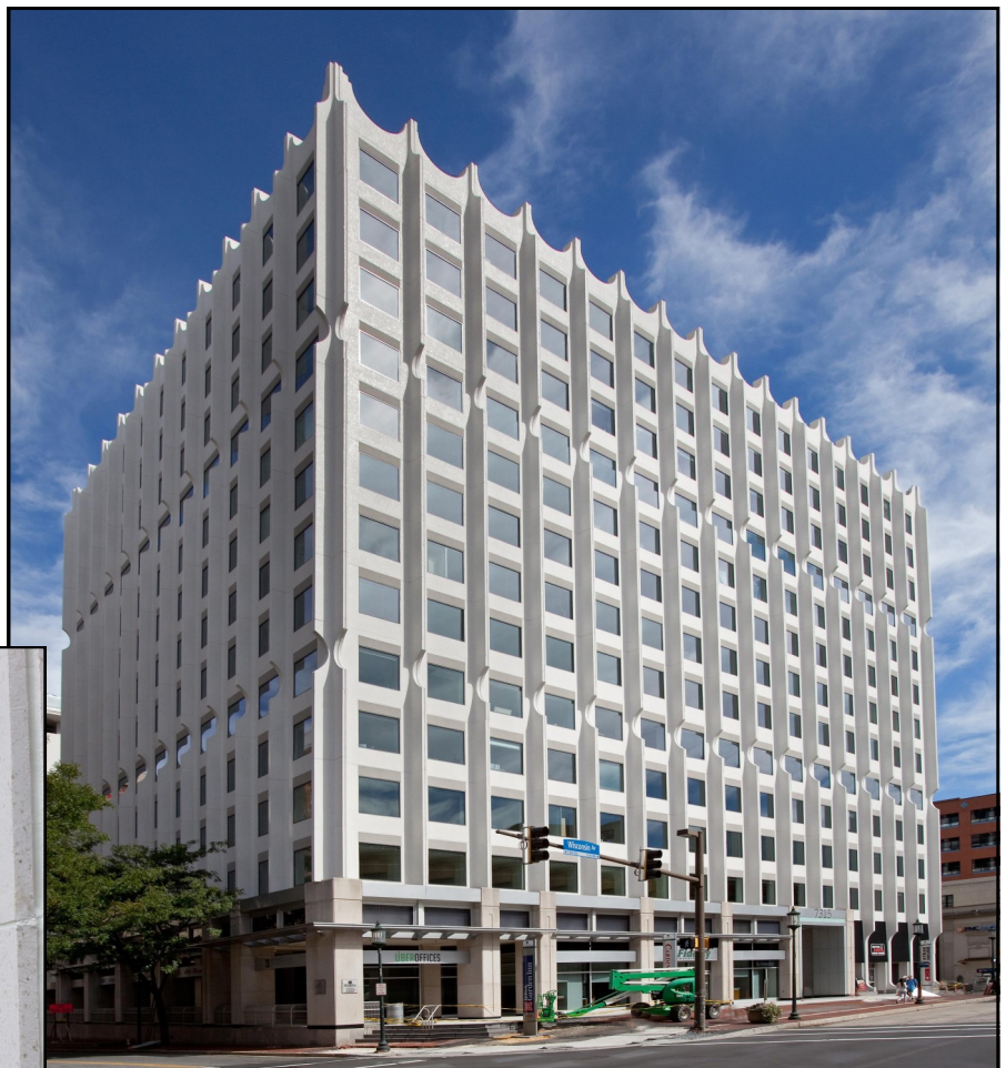
Wisconsin Tower West is shown below with new windows and Granyte finish in Show White #160. A close up of Granyte in Snow White is provided at lower left.